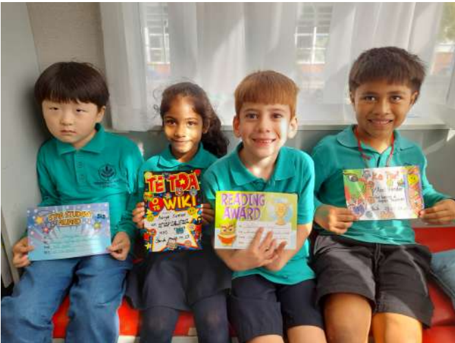
Look at our wonderful Bee Learners.