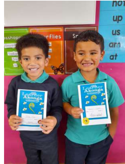
We celebrated our classroom hard workers