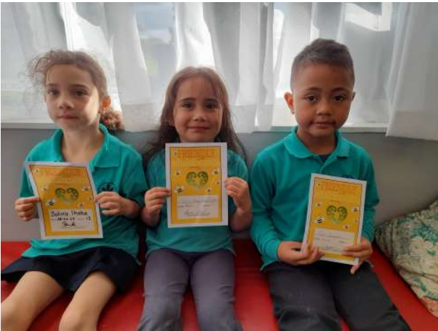
We celebrated last week's Bee Friendly for W1.

Rooms 10, 11 and 12 came together in Room 12 on Friday afternoon to celebrate all of our tamariki and their great learning since the beginning of the term.